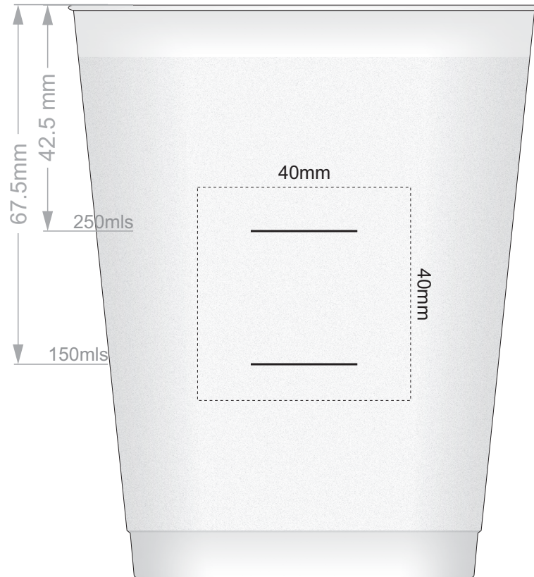
100% of Actual Size Pad Print