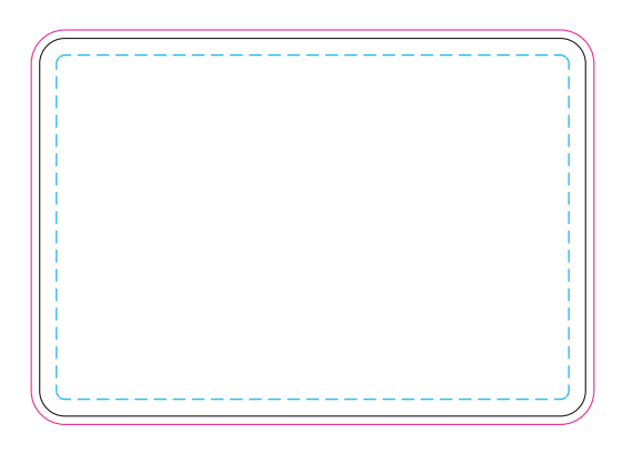
Blue Line = The SIGNIFICANT PRINT AREA (Keep all critical images & text within this box) Black Line = Maximum print area Pink Line = Bleed off to here